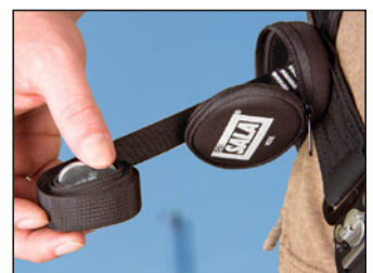
Suspension Relief Straps