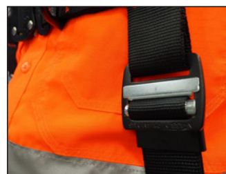
Easy to adjust torso buckles