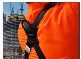
Large rear fall arrest point