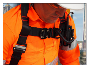
Quick Connect Buckles on chest and leg straps