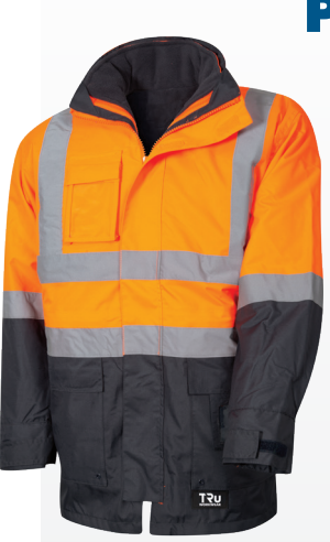
AVAILABLE IN ORANGE / NAVY