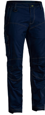
BPC6475 RIPSTOP ENGINEERED CARGO WORK PANT