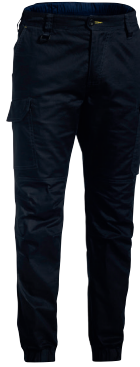
BPC6476 STOVE PIPE ENGINEERED CARGO WORK PANT