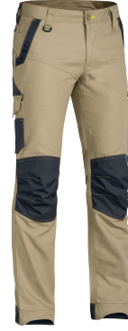
BPC6130 FLEX & MOVE™ STRETCH CARGO PANT