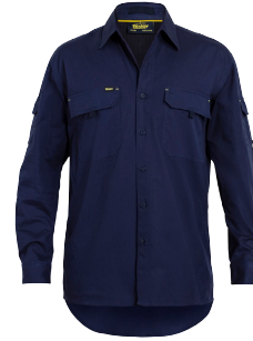
BS6414 X AIRFLOW™ RIPSTOP SHIRT LS