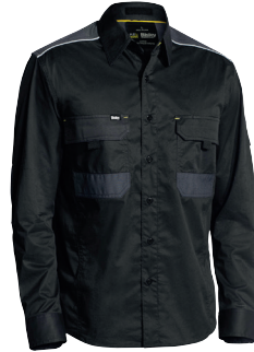
BS6133 FLX & MOVE™ MECHANICAL STRETCH SHIRT LS