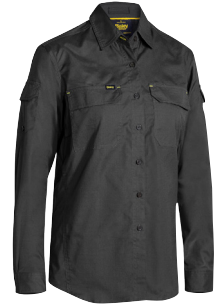
BL6414 X AIRFLOW™ RIPSTOP SHIRT LS