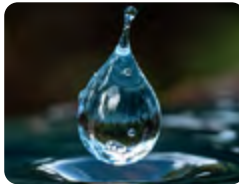
Minimising Use of Water