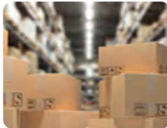
Reusing Shipping Containers