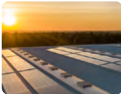
Solar Powered Warehouse Panels